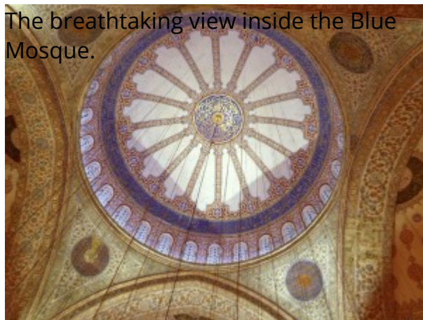
The breathtaking view inside the Blue Mosque.

There were lots of amazing things about Istanbul. There are really cute cats and dogs everywhere (we made friends with a cat we called Jeremy). The centre is always filled with people, even late at night, so there is a great atmosphere. We went in January, and there were still lots of Christmas decorations up. There are lots of great places to eat kebabs. We visited the breathtaking Sultan Ahmed Mosque, nicknamed the Blue Mosque because of the blue tiles on the interior. We checked out the bazaar, which was a complete dream – an indoor market with streets and streets of stalls to get lost in.