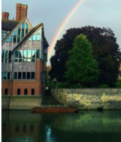
Jerwood library, Trinity Hall College (opened 1999)

From King's College chapel (built 1446-1515), to the Fitzwilliam Museum (built 1841), to Quayside (opposite Magdalene College, built 2009), the architecture of Cambridge spans many different centuries and styles. The famous bits are famous for a reason; you should definitely see them for yourself. But who knows what other, less-celebrated gems you will discover as you walk the cobbled streets?