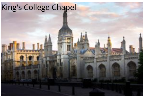
King's College Chapel

So many incredible thinkers have gone before you in Cambridge! The university was founded in 1209 , meaning that the city itself has a long and rich academic history. Some of the world's greatest minds lived and studied here... You can visit the Eagle pub where Watson and Crick first toasted making the first three-dimensional model of the structure DNA. You can stroll through the grounds of Trinity College, where Sir Isaac Newton conducted many of his now-famous experiments. And let's not forget the libraries and bookshops, where the likes of Sir Francis Bacon, Charles Darwin, Bertrand