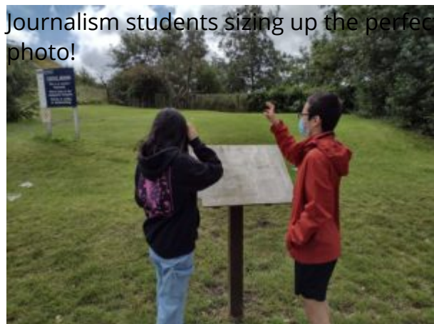
Journalism students sizing up the perfect photo!

Today we headed off into the second full day of the program with escorting the students to breakfast just before 8am, as yesterday, before they headed off to their classes.