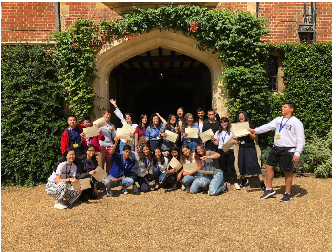
Medicine & Life Sciences with their end-of-course certificates

It is the last day of the Program 3 and we are sad that the summer is drawing to a close. But the students have been enjoying another day of learning and we are ending on a high note. We hope that lots of new friends have been made, fun activities have been enjoyed, and memories have been formed that will last a lifetime.