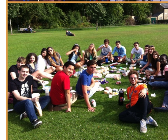
It's not just about the classroom. At Reach Cambridge we love to combine classroom learning with enriching trips to places of cultural importance across England.