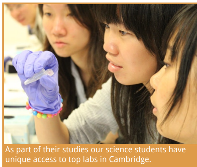
As part of their studies our science students have unique access to top labs in Cambridge.

Students will be given hands-on experience with drug design and discovery through a range of practical experiments in laboratories. Students will be offered a unique insight, therefore, into both the study of biotechnology at university and also the vocational opportunities in the field beyond higher education. This exciting and dynamic course will be a challenging but rewarding program for all those students with a passionate interest in biotechnology and biological sciences.