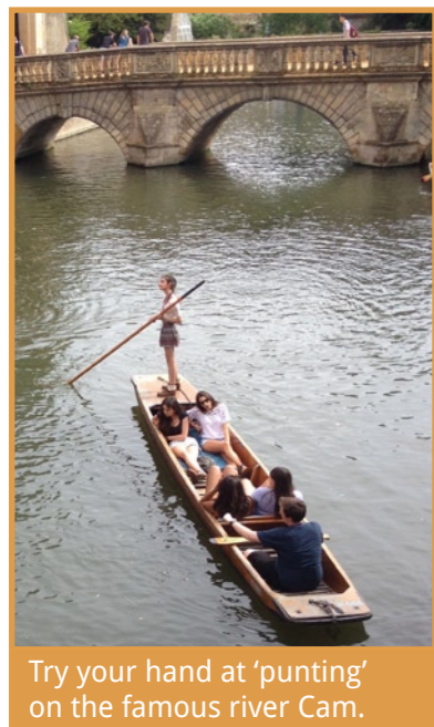
Try your hand at 'punting' on the famous river Cam.

Our experienced team of supervisors puts together a varied activity timetable, so that all Reach Cambridge students have the opportunity to participate in a broad range of activities, not only giving students a way to relax after classes, but also providing a fantastic opportunity to meet other students and form friendships.