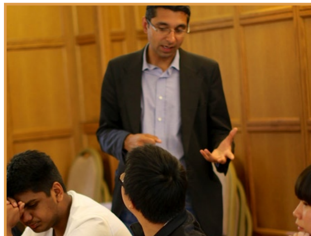
All our teachers are researchers and academics from top Universities with many from Cambridge University itself.