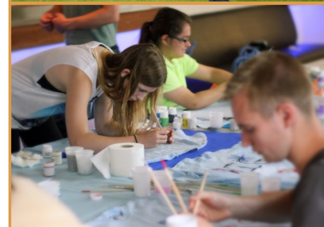
From sports to music to crafts, we run a wide variety of activities during our programmes, so that there's sure to be something for everyone!

presenting an argument, and working as part of a team. There will be a focus on both UK and international law, as students are encouraged to think critically about legal issues facing the world in the 21st century, globalised society. In addition, there will be an opportunity to visit law courts and understand the range of career opportunities in the sector. This dynamic course will introduce students to both the academic complexities and the vocational opportunities of the subject.