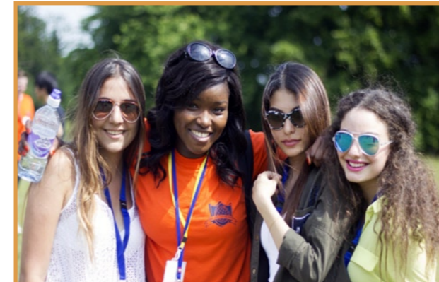
We pride ourselves on our brilliant Supervisor team. Our Supervisors are here to support students, arrange activities and make sure Reach students have the summer of their lives!