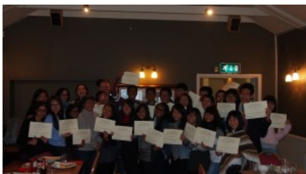
Students with their certificates

This course was a great academic opportunity, with excellent teachers offering classes on a range of interesting topics, from varieties in American English to psycholinguistics. But it was also a chance for students to immerse themselves in a different culture and environment, an opportunity that everyone made the most of. Catholic Junior College have also written about the course, so to learn more about the students' thoughts click here .