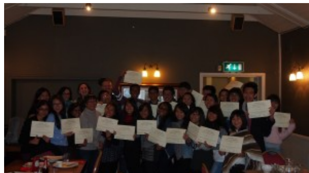
Students with their certificates

This course was a great academic opportunity, with excellent teachers offering classes on a range of interesting topics, from varieties in American English to psycholinguistics. But it was also a chance for students to immerse themselves in a different culture and environment, an opportunity that everyone made the most of. Catholic Junior College have also written about the course, so to learn more about the students' thoughts click here .