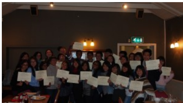
Students with their certificates

This course was a great academic opportunity, with excellent teachers offering classes on a range of interesting topics, from varieties in American English to psycholinguistics. But it was also a chance for students to immerse themselves in a different culture and environment, an opportunity that everyone made the most of. Catholic Junior College have also written about the course, so to learn more about the students' thoughts click here .