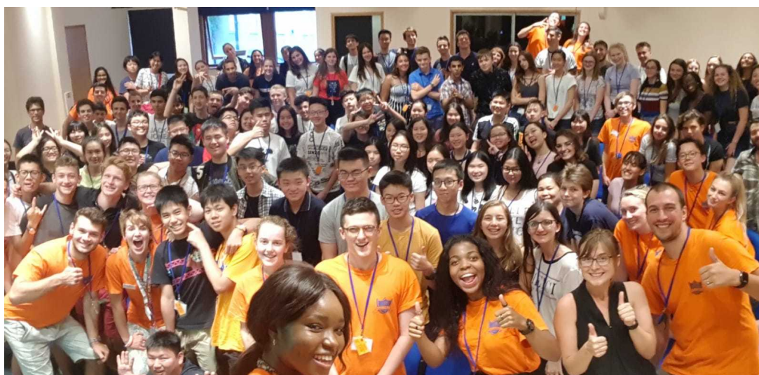
Reach Program Selfie!

Whether you're used to small-town life or big-city living, Cambridge will always offer something unique to each visitor, infused with aromas from all around the world. As you can see from our students, Reach Cambridge programs provide a fantastic doorway into this international city. It's the perfect place to expand your horizons and broaden your mind. Check out our programs today!