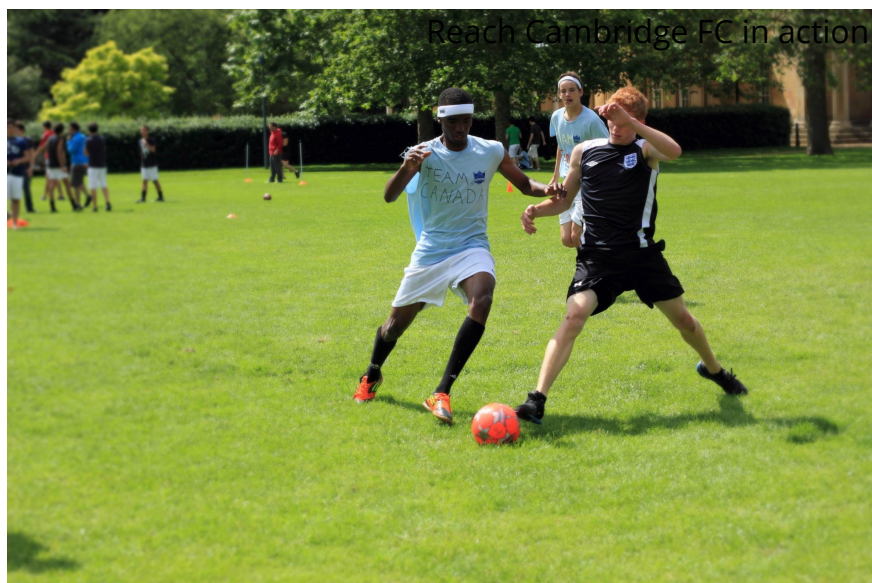
Reach Cambridge FC in action!