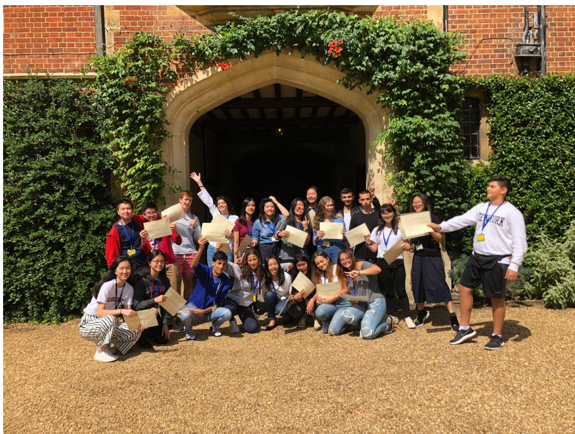
Medicine & Life Sciences with their end-of-course certificates

It is the last day of the Program 3 and we are sad that the summer is drawing to a close. But the students have been enjoying another day of learning and we are ending on a high note. We hope that lots of new friends have been made, fun activities have been enjoyed, and memories have been formed that will last a lifetime.