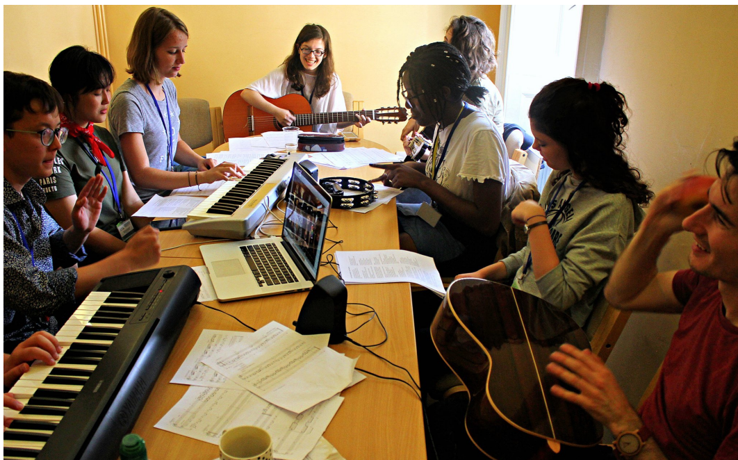
Music composition is more fun with friends!

You can add a Taster course on at the initial stage of submitting an application. If you've already submitted an application, simply email info@reachcambridge.com and we can make the necessary changes to your online account.