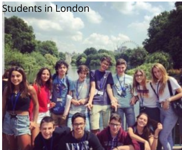
Students in London

Despite it only feeling like five minutes ago since Reach Summer 2018 began, our second round of weekend excursions has begun. The last week has been filled with fun, activities and learning, but it's also been hard work, and so everyone was in need of some adventure. We at Reach Cambridge like to think that we provided this by spoiling our students with a second trip to London!