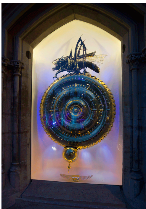
Time is but a concept, says the Corpus Clock

Archaeological evidence suggests the settlement has been there since prehistoric times, although the name 'Cambridge' doesn't really come into play until the Middle Ages.