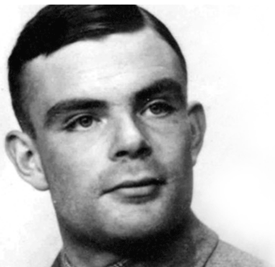
Benedict Cumberbatch played him in 'The Imitation Game', but this is the real Alan Turing!