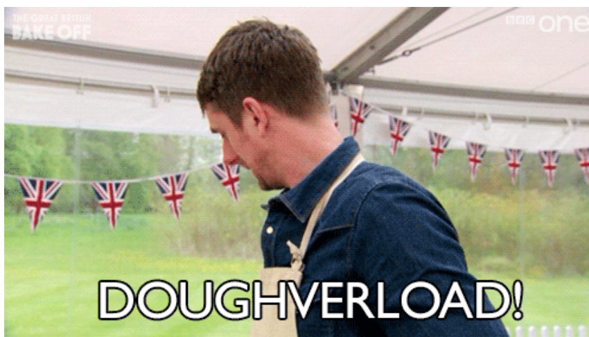
Sugary goodness the Great British Bake Off can but dream

Chelsea Buns are a type of currant bun first created in Chelsea in the 18th century. These delicious pastries are flavoured with spices and are presented in an iconic spiral shape. The ones at Fitzbillies are incredibly sticky and sweet. A must-taste attraction for anyone visiting Cambridge!