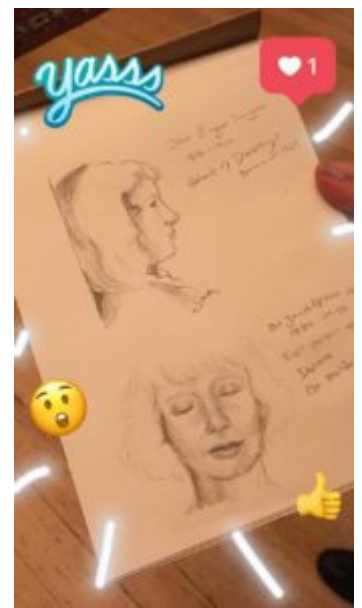
Incredible student drawing!

paintings from antiquity. After having a wander around, students settled down to sketch the works found in the museum, as well as numerous portraits of supervisor Amy herself! After both activities, lots of students treated themselves to ice-creams - thoroughly deserved after a busy day of hard work!