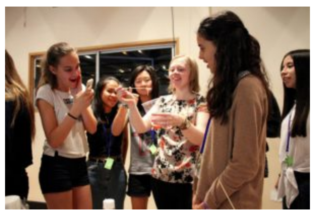
Science magic in DNA extraction!

After the slightly worrying rumbling of thunder , day four of Reach blessed us with another beautiful day! With the summer school now getting into the swing of things, students enjoyed a multitude of intriguing subjects - everything from modernism and its difficulties in English Literature & Performance to the intricacies of legislation & litigation in the Law class. In Life Sciences & Medicine, the students got up close and personal with science, extracting DNA from a strawberry during a practical. The DNA separated in the form of a white fibrous substance, appearing to be much like candy floss!